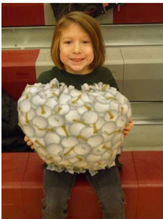
(left) One of many completed fleece pillows

Without the assistance of amazing 4-H volunteers events like this one would not be possible!