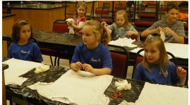
(right) Youth getting ready to tie-dye T-shirts